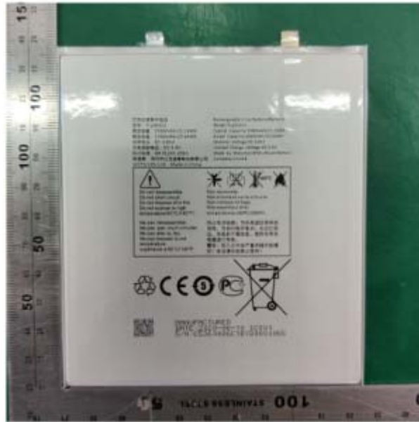
Cell/电芯 (CSL26A5B8 3.85V 5410mAh)