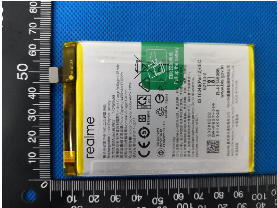
Fig. 1 – Front view of Battery