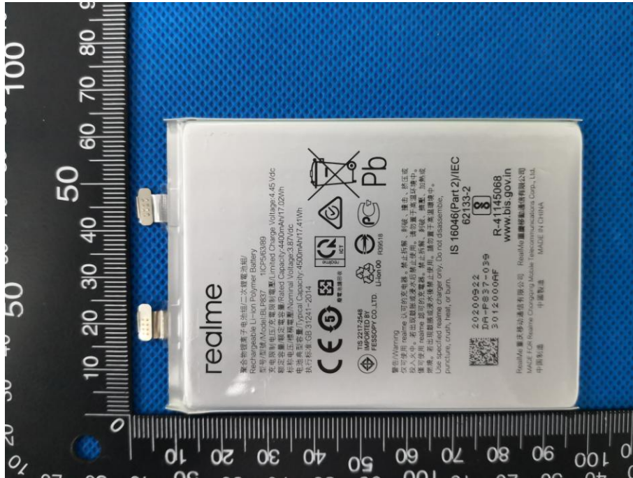
Fig. 3 – Front view of Cell